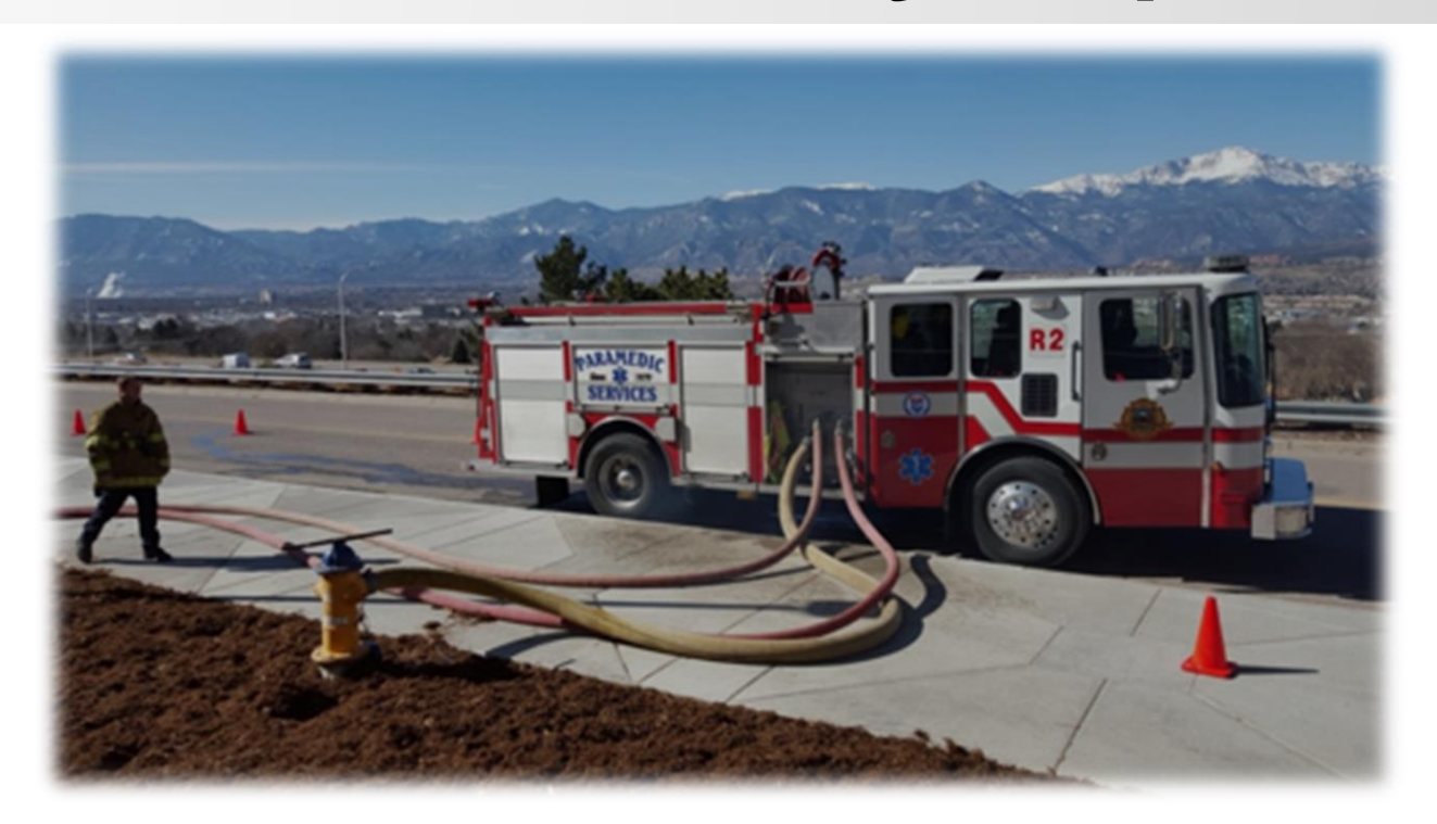
Prepared by: Environmental Health and Safety (EH&S)

This report contains information from calendar year 2021